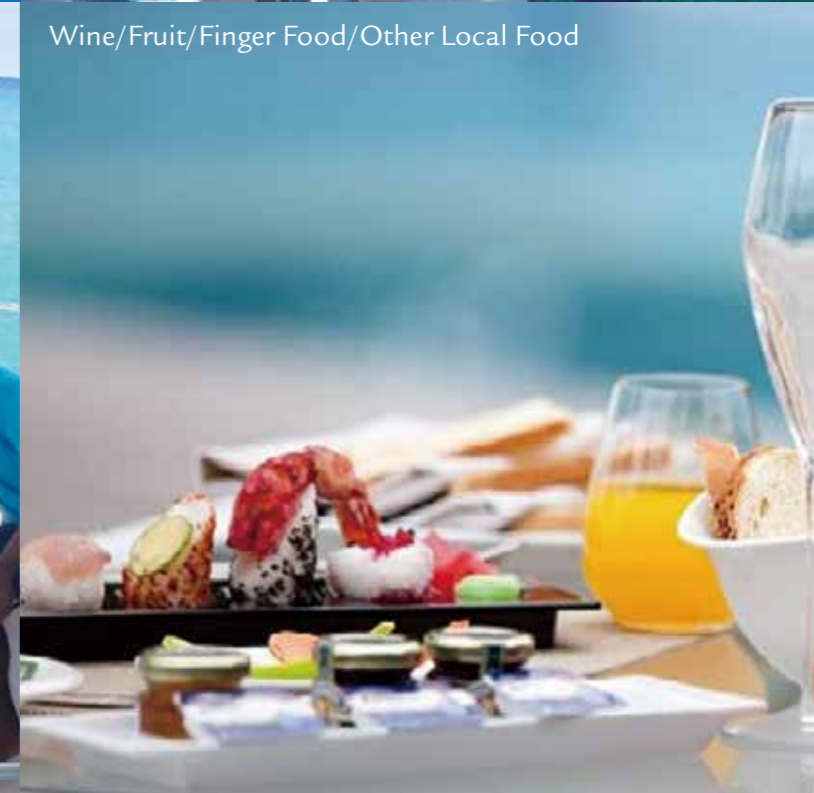
Wine/Fruit/Finger Food/Other Local Food